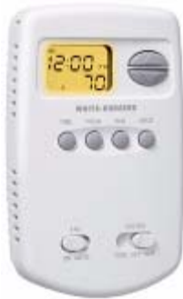
42 04247244 $50.00 Our 'good' model

Thermostats - our models can be used for Gas, Oil or Electric applications