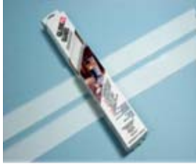
$30.99 98 046GLIDE-1