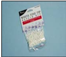
98 02212022-B (Blue) $11.99 98 022676458 (Grey) $19.99 98 022675679 (White) $15.99