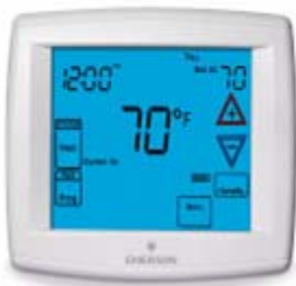
42 04247259 $230.00 Our 'best' model