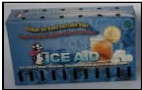
$9.99 98 046ICE-AID

Glide n' Guard Floor Protectors help easily move heavy appliances away from walls for cleaning or repair, and guard against damage to expensive floors. Six interlocking polyethylene tracks with lipped edges; two of the six 3-3/4"x26" long tracks remain under the appliance feet and out of sight. When it's time to move the fridge or stove, simply interlock the other four tracks with the two already there, and slide the appliance out easily - on the tracks, not the floor, protecting it from scratches and gouges.