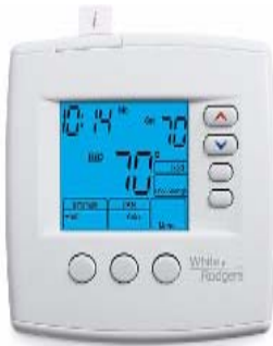
42 04247148 $110.00 Our 'better' model