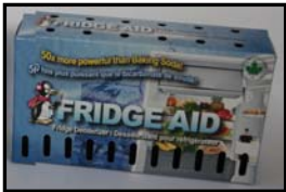
$9.99 98 046FRIDGE-AID

Keeps ice cubes tasting fresh. Ice Aid has a special formulation made to absorb ice cubes and freezer odours. Contains high absorbency natural activated charcoal. Lasts up to 8 months.