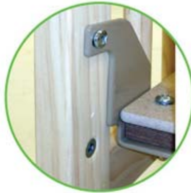
new bracket / nouveau modèle de dispositifs de métal