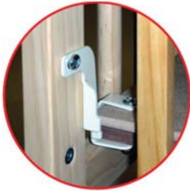
old bracket / ancien modèle de dispositifs de métal